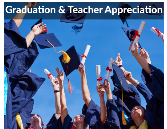
Graduation & Teacher Appreciation

Celebrate the moms in your life with meaningful gifts, from flowers to curated baskets—perfect for showing appreciation this Mother's Day.