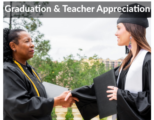
Graduation & Teacher Appreciation

Celebrate the moms in your life with meaningful gifts, from flowers to curated baskets—perfect for showing appreciation this Mother's Day.